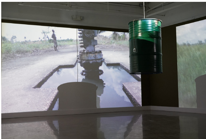
Installation image courtesy of the artist