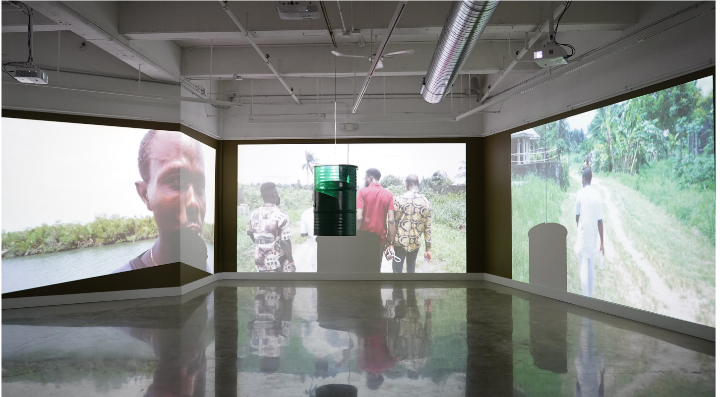
Installation image courtesy of the artist