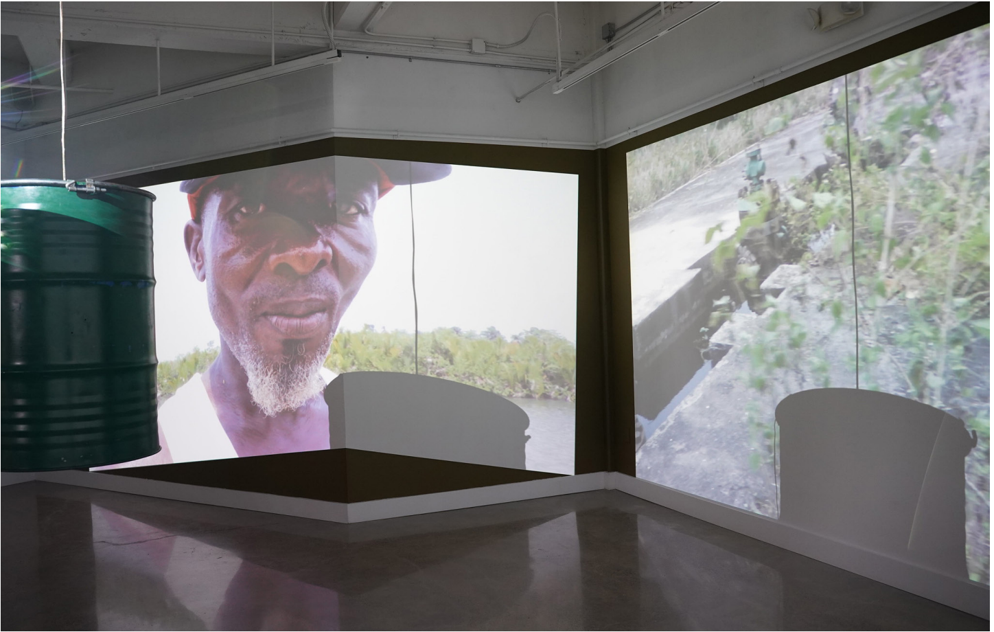
Installation image courtesy of the artist